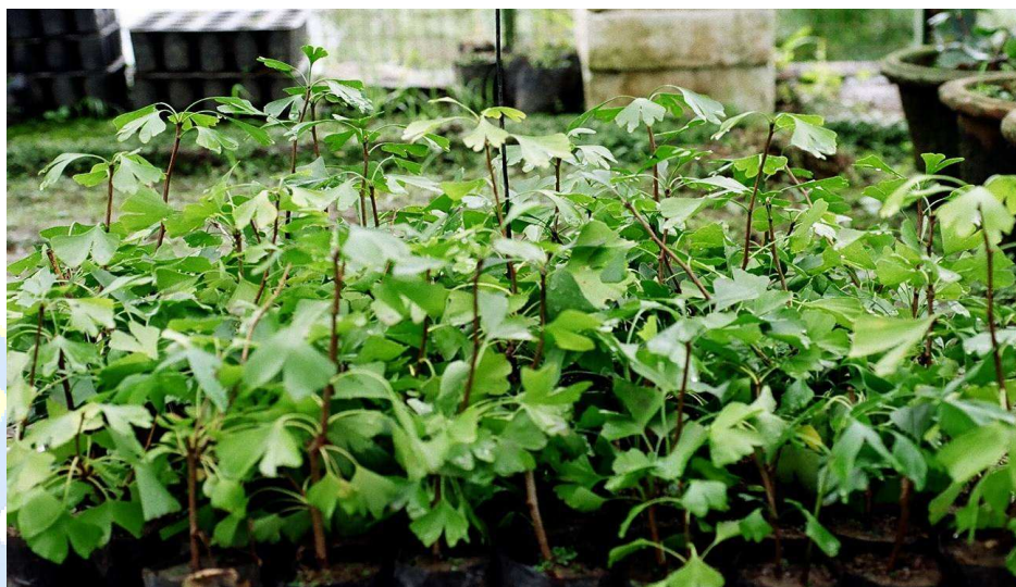
Fig. 2: Use of endophytic bacteria for raising healthy plants of Ginkgo biloba under net-house conditions